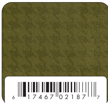
7564-45 DARK GREEN