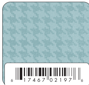
7564-80 LT TURQUOISE