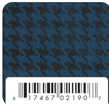
7564-55 DARK BLUE