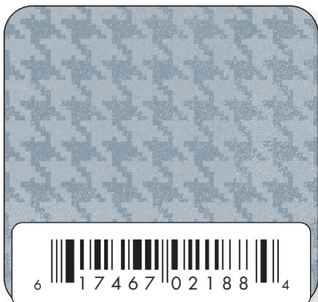
7564-50 LIGHT BLUE