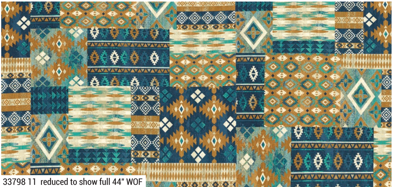
33798 11 reduced to show full 44" WOF