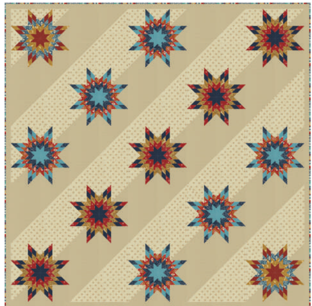
MOD 116 Spurs and Stripes | 62" x 62"