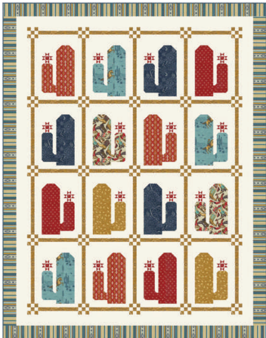
WS 16 Cactus | 72" x 92"