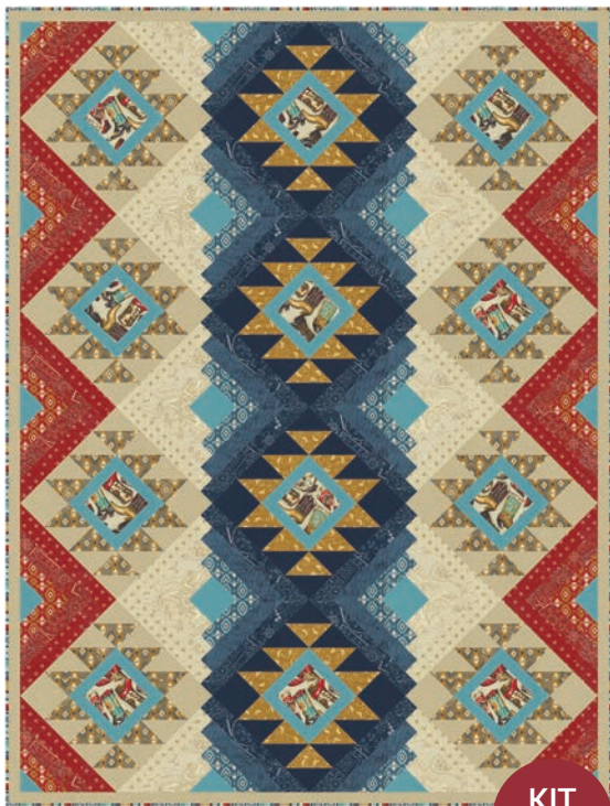
MOD 115 Rocky Ridge | 53" x 70"